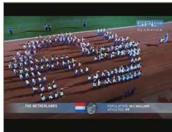
NS / Olympic Games